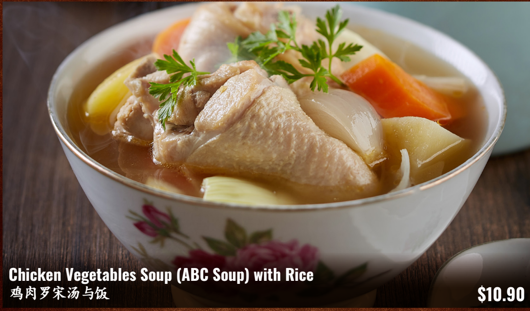
Chicken Vegetables Soup (ABC Soup) with Rice 鸡肉罗宋汤与饭