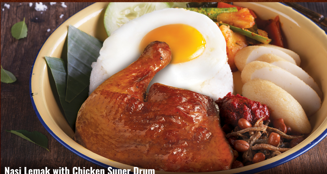
Nasi Lemak with Chicken Super Drum