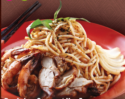
Dry Laksa Goreng / Hor Fun (Served with Chicken, Prawn and Egg) 干炒叻沙粗米粉/河粉 (包括鸡肉, 虾和蛋)