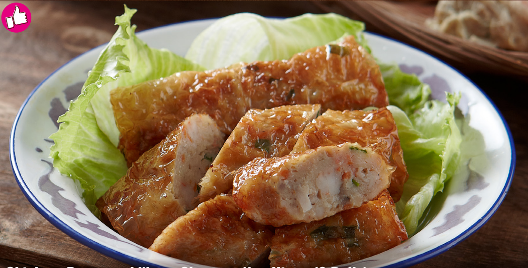
Chicken, Prawn and Water Chestnut Ngo Hiang (3 Rolls)