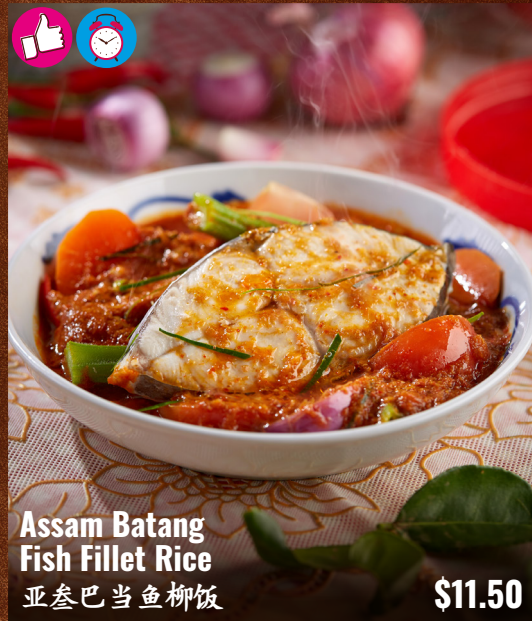
Assam Batang Fish Fillet Rice 亚叁巴当鱼柳饭