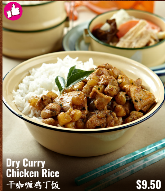
Dry Curry Chicken Rice 干咖喱鸡丁饭