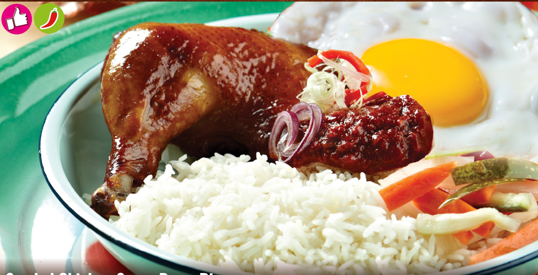
Sambal Chicken Super Drum Rice 参巴鸡腿饭