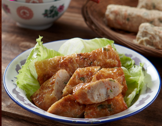
Chicken, Prawn and Water Chestnut Ngo Hiang (3 Rolls) 五香 (三条)