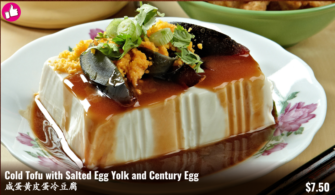
Cold Tofu with Salted Egg Yolk and Century Egg 咸蛋黄皮蛋冷豆腐