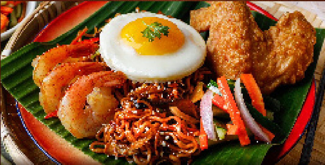
Mushroom Noodles with Chicken, Prawn and Egg