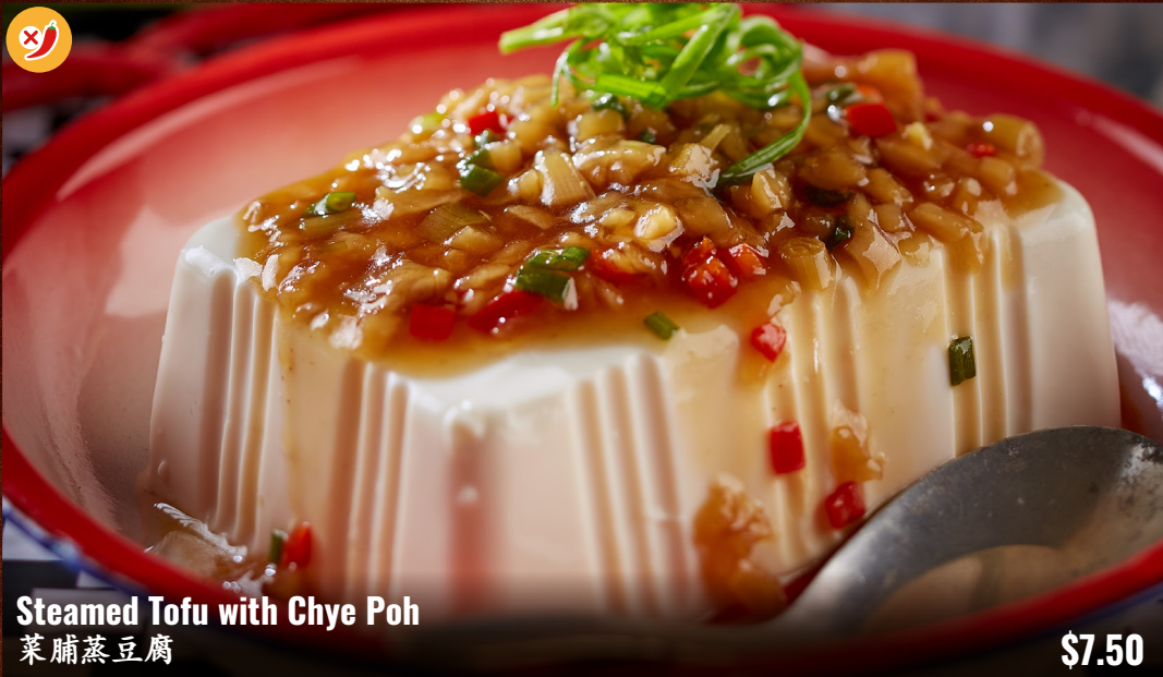
Steamed Tofu with Chye Poh 菜脯蒸豆腐