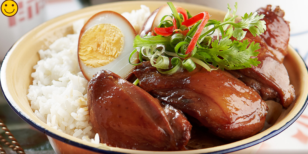
Soya Sauce Chicken Rice 酱油鸡饭