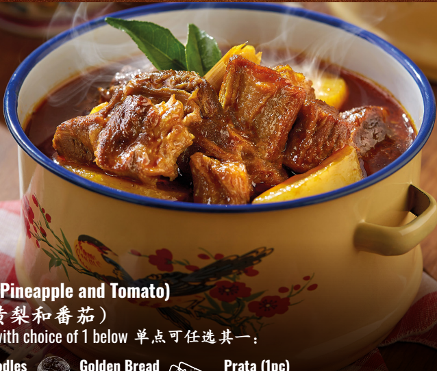
Curry Beef (with Pineapple and Tomato) 咖喱牛腩 (配黄梨和番茄)

*Single portion comes with choice of 1 below 单点可任选其一: