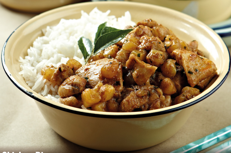
Dry Curry Chicken Rice 干咖喱鸡丁饭