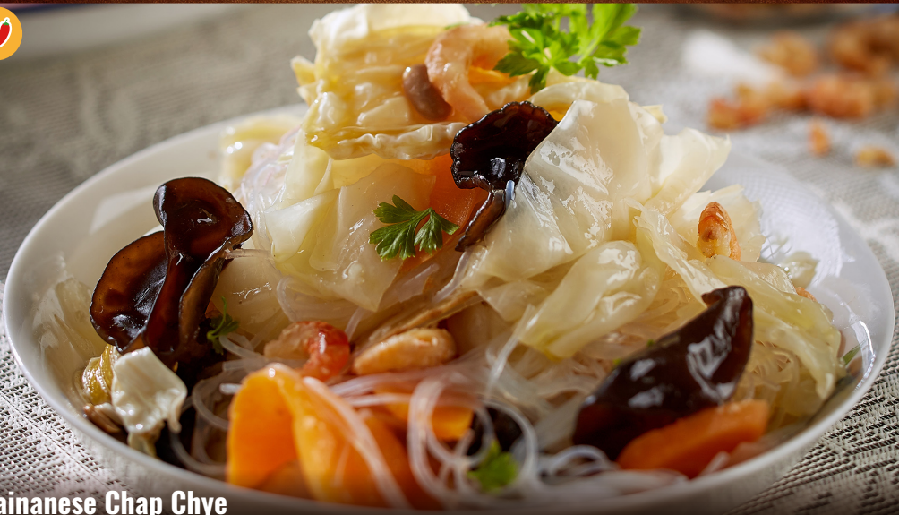
Hainanese Chap Chye 海南杂菜