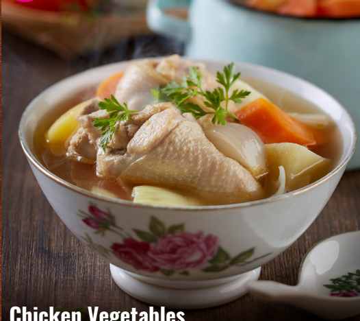
Chicken Vegetables (ABC Soup) with Rice 鸡肉罗宋汤与饭