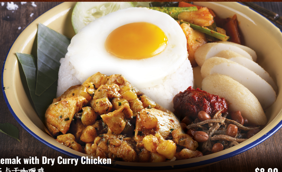
Nasi Lemak with Dry Curry Chicken