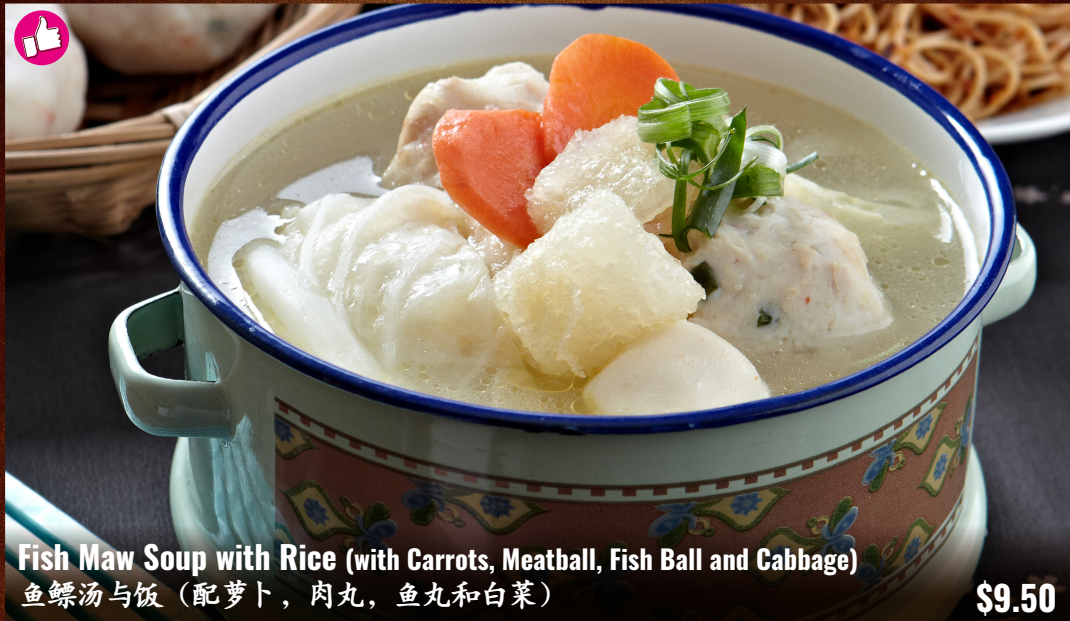
Fish Maw Soup with Rice (with Carrots, Meatball, Fish Ball and Cabbage) 鱼鳔汤与饭 (配萝卜, 肉丸, 鱼丸和白菜)