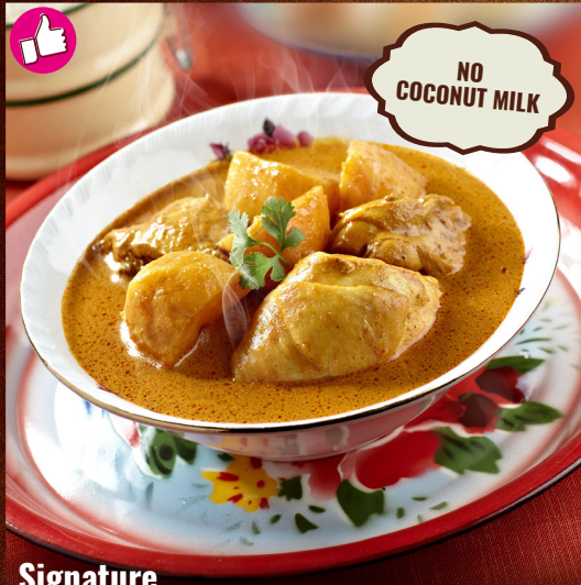
Signature Curry Chicken 招牌咖喱鸡