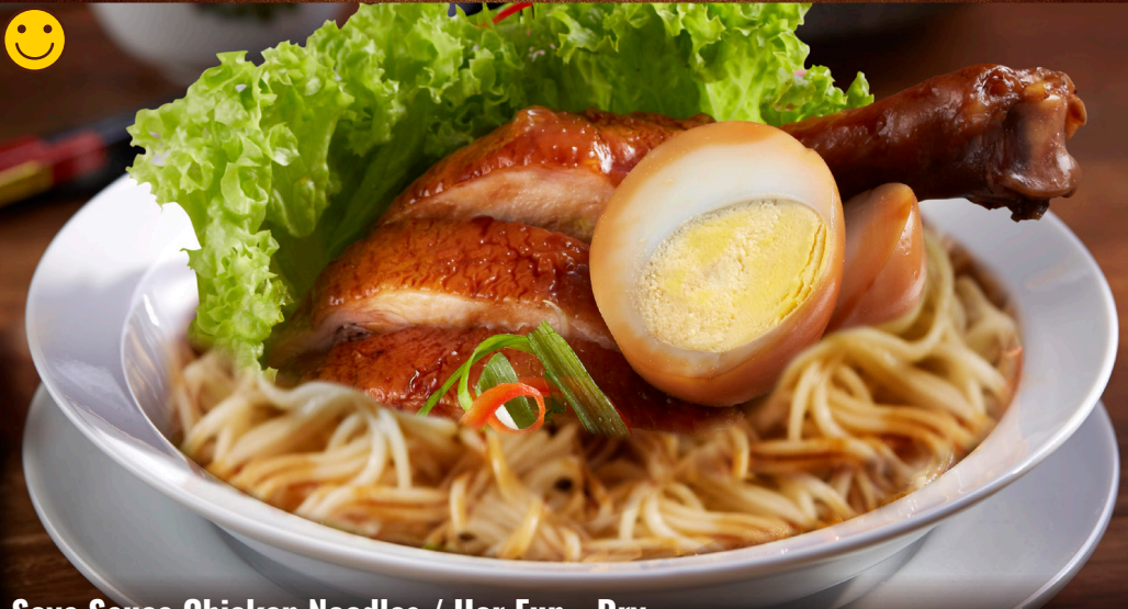
Soya Sauce Chicken Noodles / Hor Fun - Dry