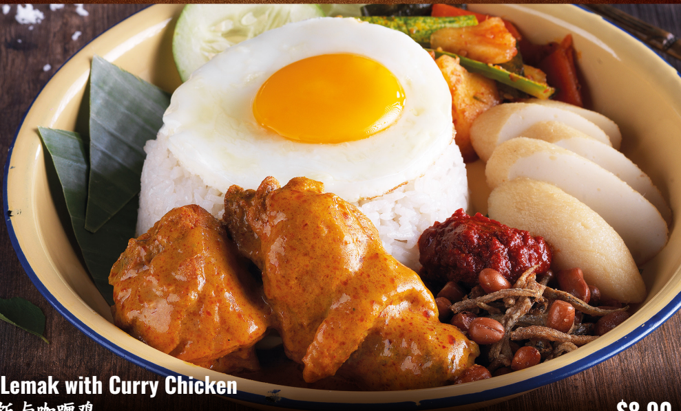
Nasi Lemak with Curry Chicken