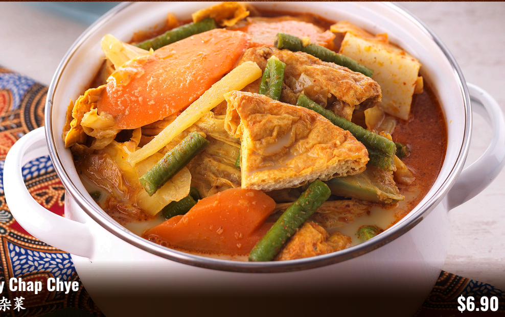
Curry Chap Chye 咖喱杂菜