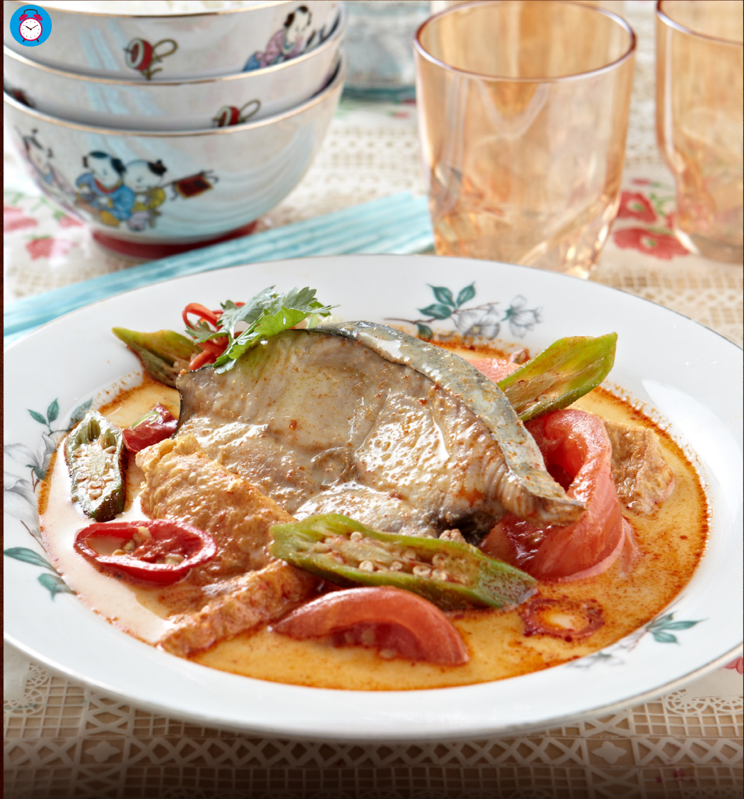
Curry Batang Fish Fillet Rice 咖喱巴当鱼柳饭