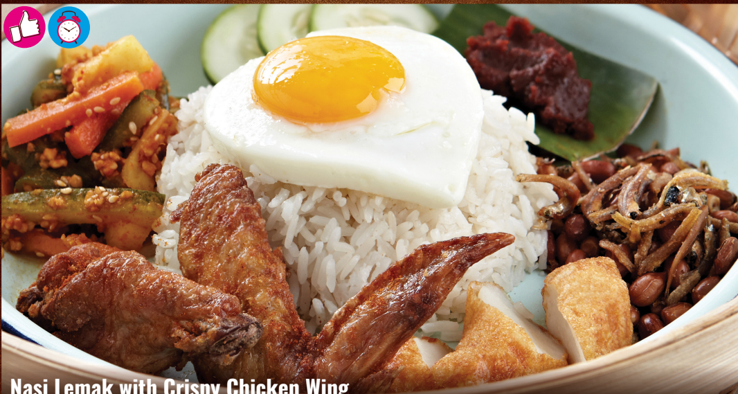
Nasi Lemak with Crispy Chicken Wing