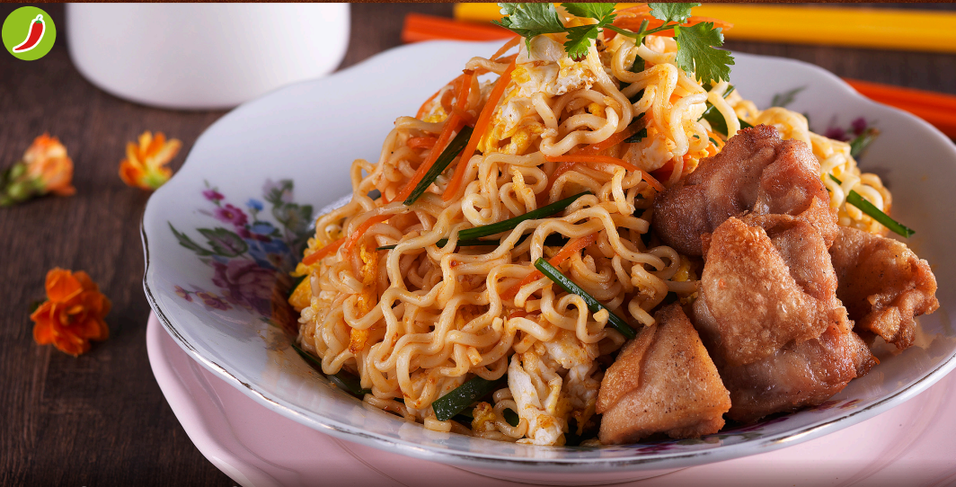
Fried Curry Maggi Goreng (Served with Fried Chicken and Egg)