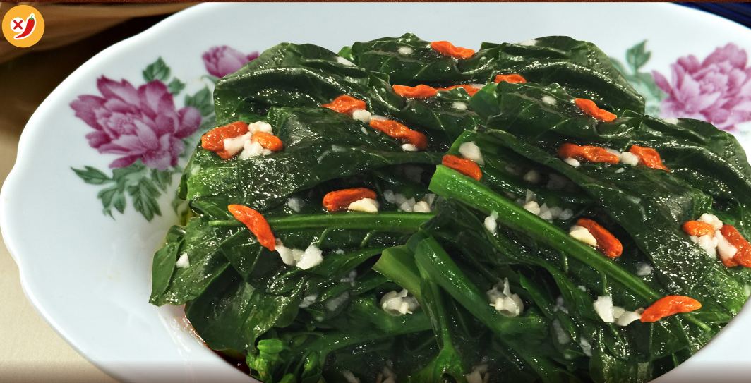
Poached Vegetables with Oyster Sauce / Garlic 蚝油/蒜蓉炒时蔬