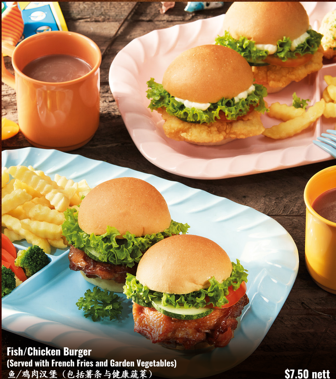
Fish/Chicken Burger (Served with French Fries and Garden Vegetables) 鱼/鸡肉汉堡 (包括薯条与健康蔬菜)

Every Kids Meal comes with choice of Soya Milk or Milo. 儿童套餐包括豆奶或美禄。