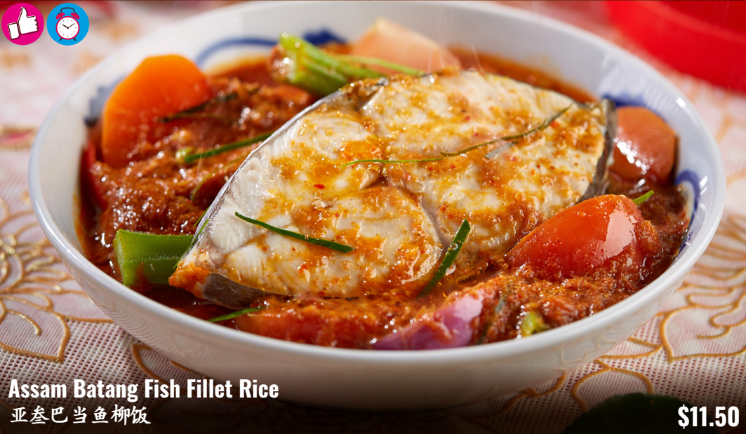
Assam Batang Fish Fillet Rice