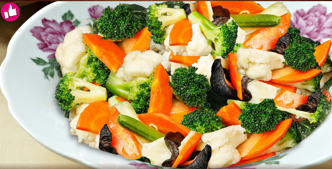
Mixed Vegetables with Broccoli, Cauliflower, Mushroom & Carrots 清炒时蔬