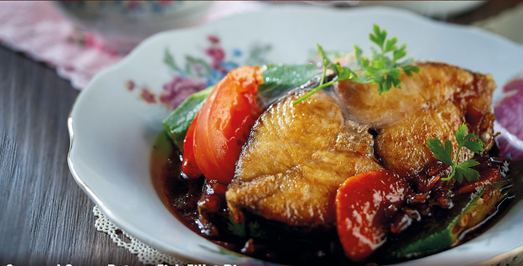
Seaweed Sauce Batang Fish Fillet Rice