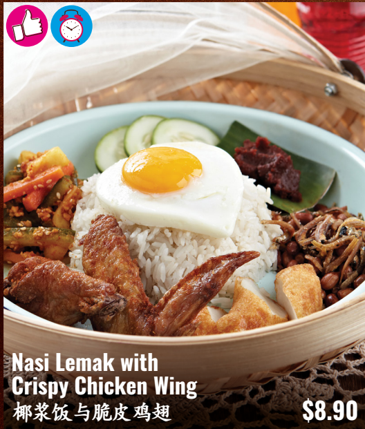
Nasi Lemak with Crispy Chicken Wing 椰菜饭与脆皮鸡翅