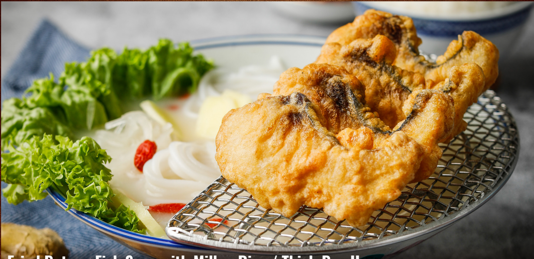
Fried Batang Fish Soup with Milk – Rice / Thick Bee Hoon (with Radish and Wolfberry)