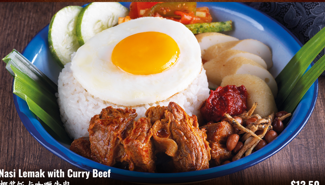
Nasi Lemak with Curry Beef