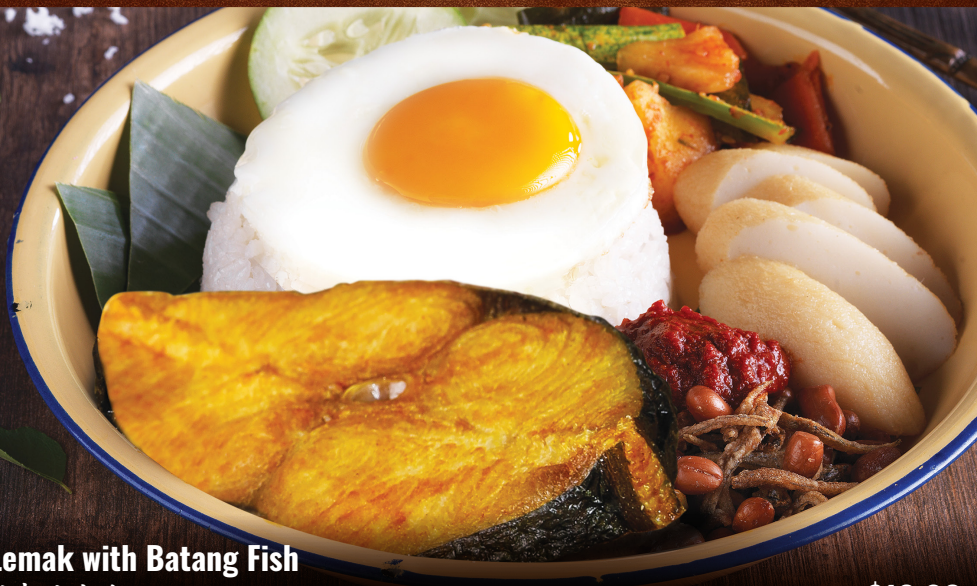
Nasi Lemak with Batang Fish