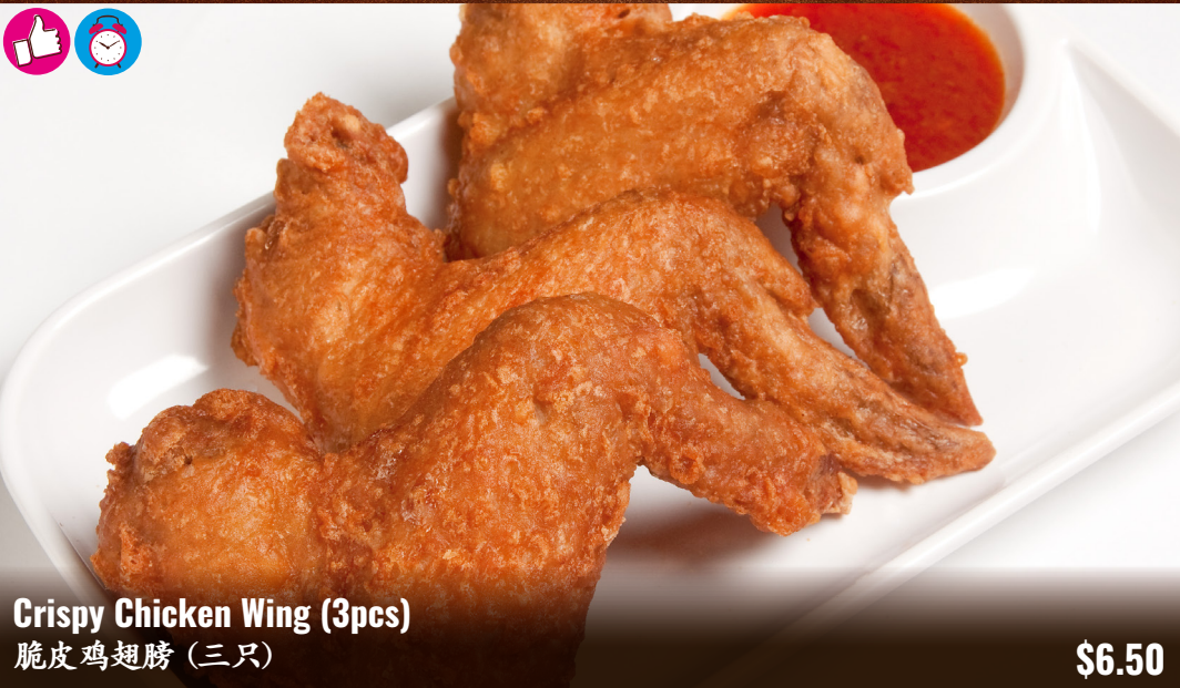
Crispy Chicken Wing (3pcs)